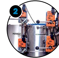
2 SS 3A Motorized valves