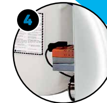
4 pH control