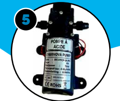
5 Acid pump