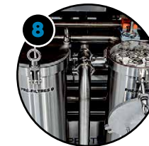
8 Prefilters management