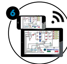
6 Remote Web access