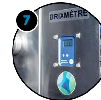
7 Brix control