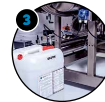
3 CIP Tank soap pump